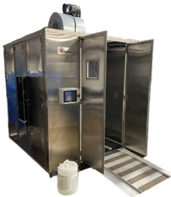
Quaternary Chamber (w/ sump, ramp, and blower)