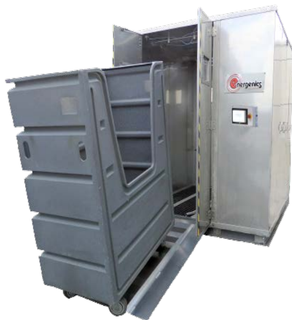
HOCL Chamber (w/ sump, ramp)