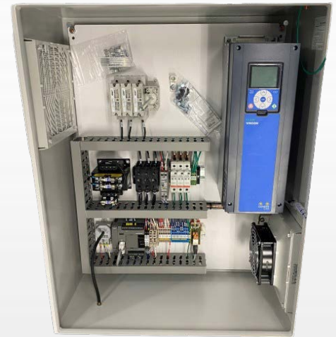
Enclosure Option w/ HMI (interior view)

Note: Changes in back-pressure measured in inches of water column (WC). The system, utilizing a variable frequency drive, maintains airflow at .05" WC.