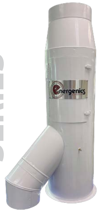
In-Duct AF-S Filter (self cleaning model)