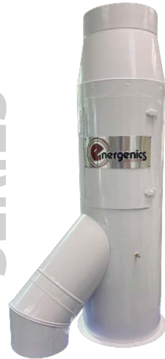
In-Duct AF-S Filter (self cleaning model)