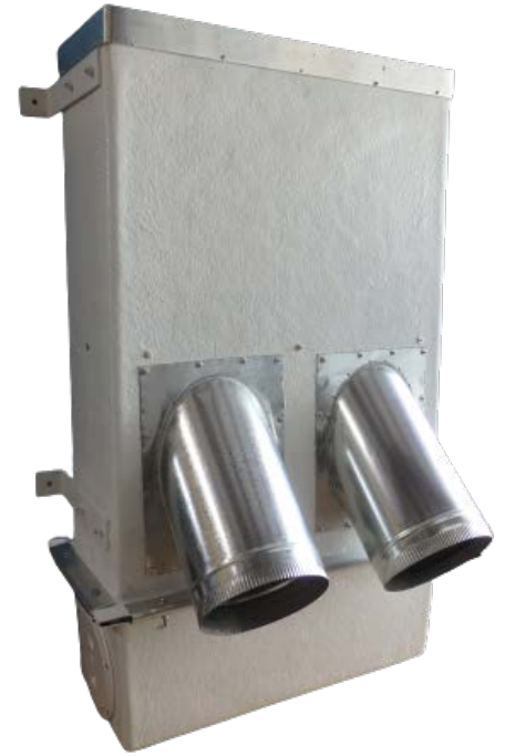
AF-2 Multi-Dryer Top Discharge w/ 8" Inlets